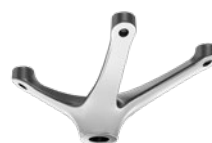
SPIDER SWIVEL SUPPORT (W/O HEIGHT ADJ.) CODE: 1050540