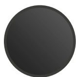
BLACK PAINTED COLUMN