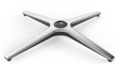
TREVI XL 4 STAR BASE MORSE CONE Ø 50 mm CODE: 5010830