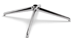
SUPERLEGGERA – LOW 4 STAR BASE MORSE CONE Ø 50 mm CODE: 5010465