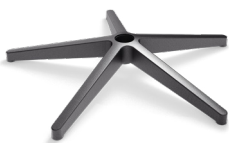
DB1.13 XL - Ø 737 mm (NYLON) CODE: 5012080