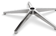
DB1.13 XL - Ø 737 mm (ALUMINIUM) CODE: 5010870