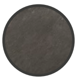
BLACK PLASTIC UPHOLSTERY PLATE