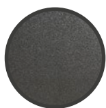
BLACK PLASTIC COVERS